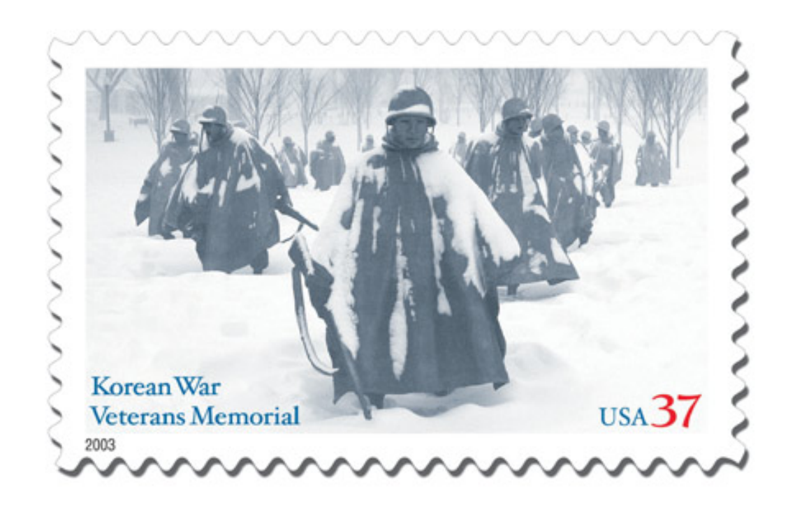
JA 1208 (Plaintiff's Exhibit 27C, Korean War Veterans Memorial Stamp (enlarged))

On July 27, 2003, the Postal Service issued the stamp. JA 461 (Stip. ¶14). The Postal Service produced approximately 86.6 million stamps and a variety of retail goods featuring the image of the stamp before retiring it on March 31, 2005. JA 462 (Stip. ¶15).