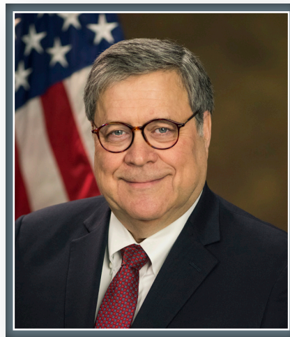
The Honorable William P. Barr Attorney General