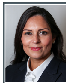
The Right Honorable Priti Patel MP Home Secretary (UK)

Plus panel discussions and presentations from the National Center for Missing and Exploited Children and other organizations, state and local law enforcement, and survivors of child exploitation.