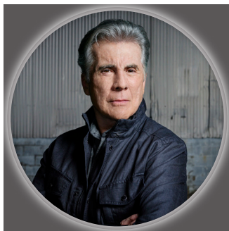
John Walsh Investigation Discovery's In Pursuit with John Walsh and Co-Founder, The National Center for Missing & Exploited Children

Plus panel discussions and presentations from the National Center for Missing and Exploited Children and other organizations, state and local law enforcement, and survivors of child exploitation.