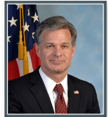
The Honorable Christopher Wray FBI Director